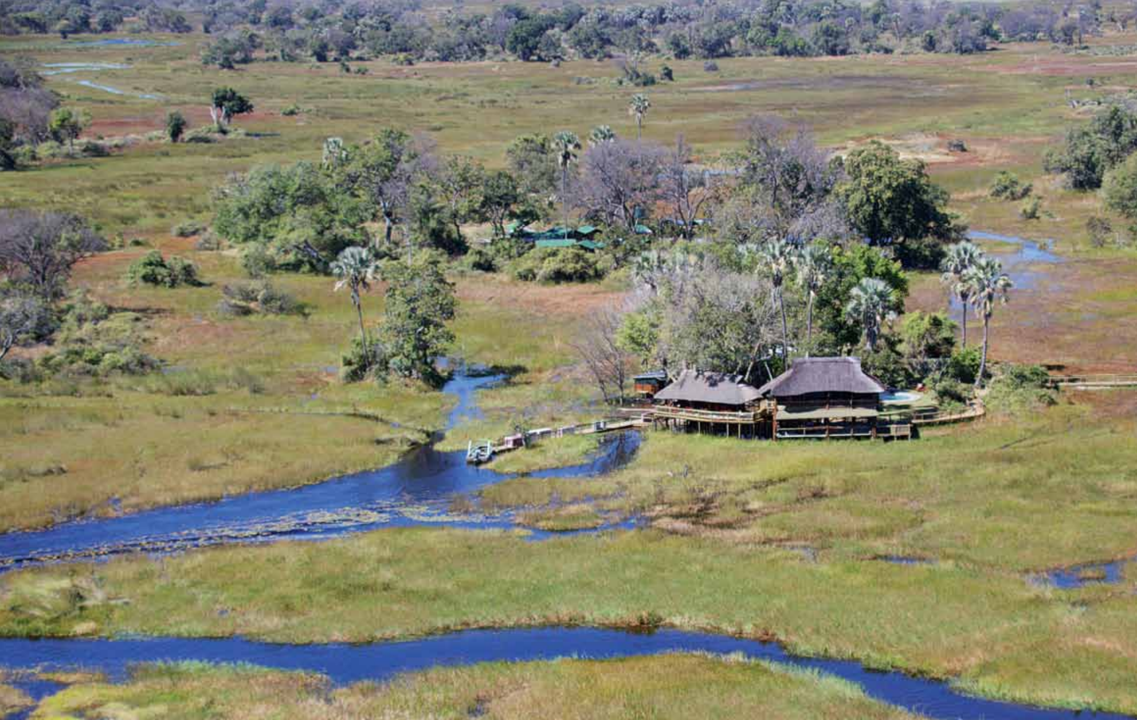
FLOOD PLAINS OF THE OKAVANGO DELTA